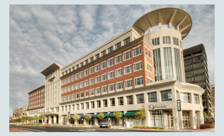
MAIN @ BROAD